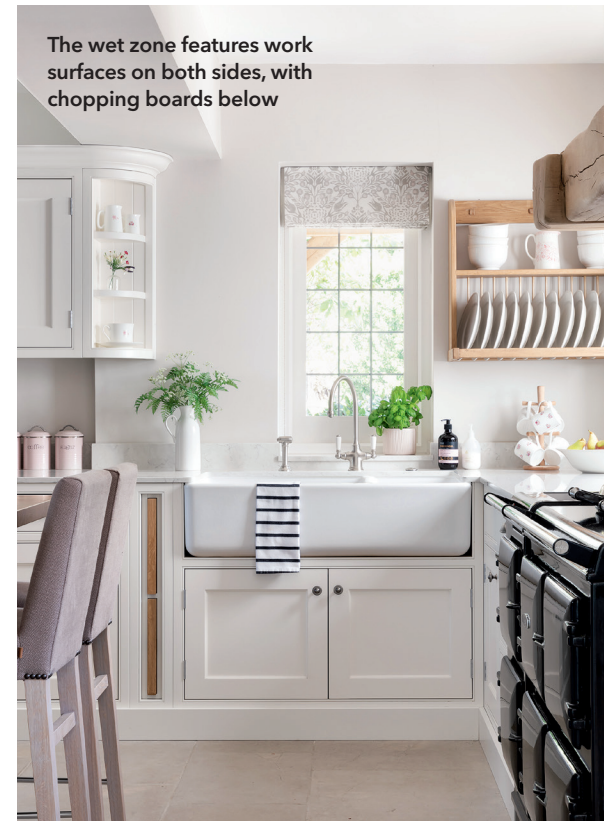
The wet zone features work surfaces on both sides, with chopping boards below