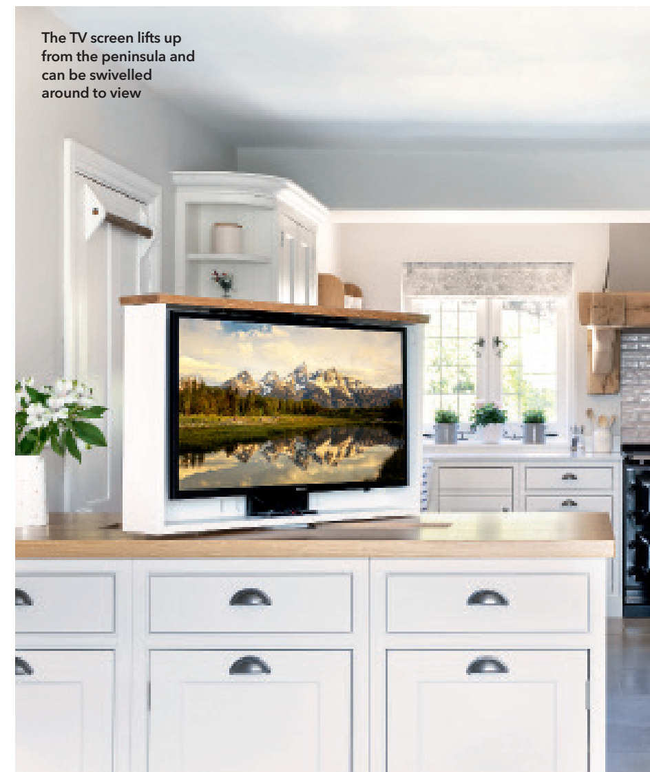
The TV screen lifts up from the peninsula and can be swivelled around to view