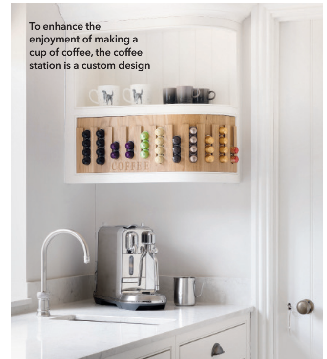
To enhance the enjoyment of making a cup of coffee, the coffee station is a custom design

Inspired by a TV on their boat which lifted out of the work surface to save space, Jane and Ian requested a similar design for their kitchen. They chose not to have a wall-hung screen, since they felt this would be too obtrusive. The Myers Touch created a bespoke slot in the peninsula top to hide the TV screen, which lifts up on a special mechanism when required. The screen can be rotated by 180 degrees to be seen from both the island and the dining area.