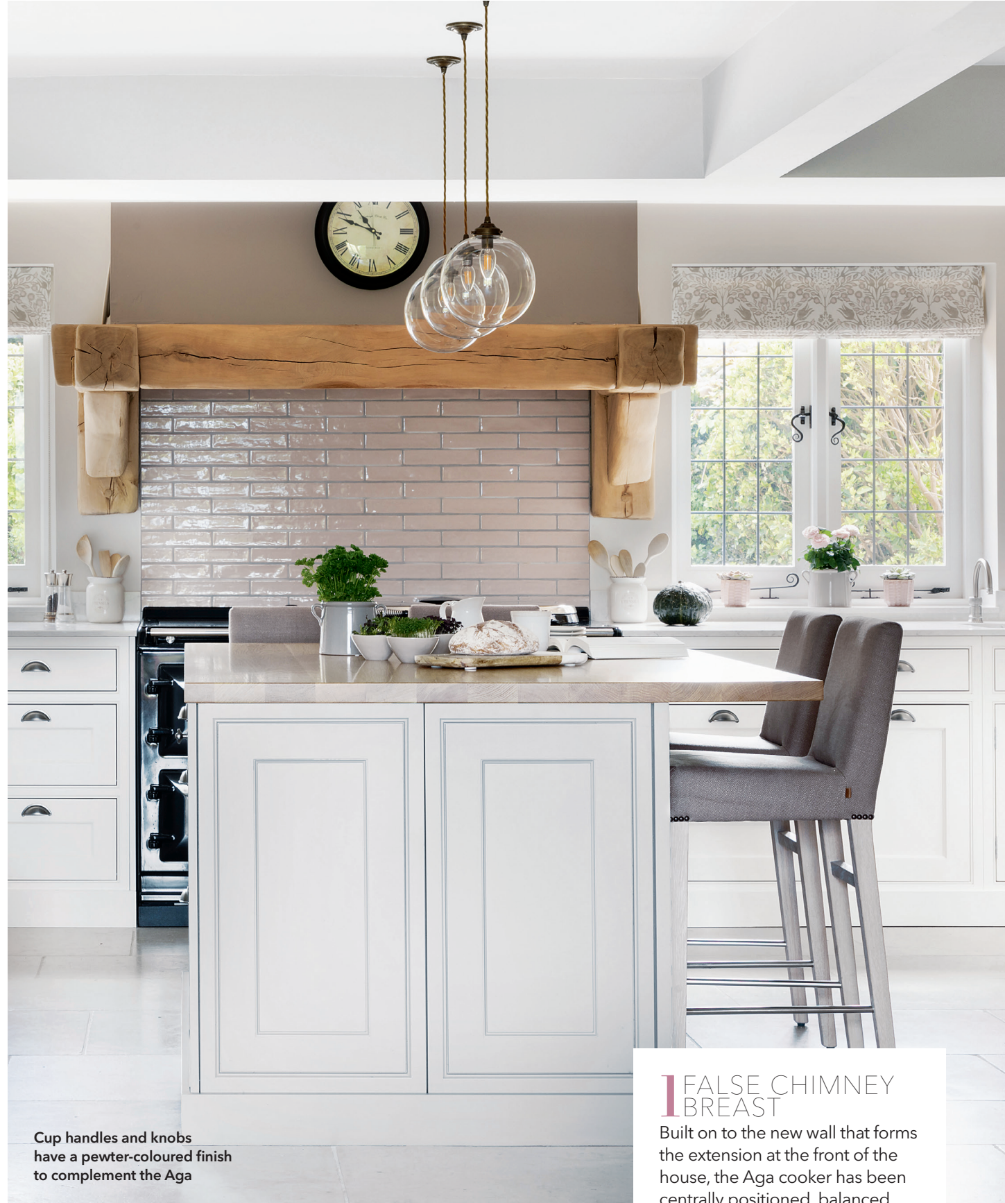
Cup handles and knobs have a pewter-coloured finish to complement the Aga