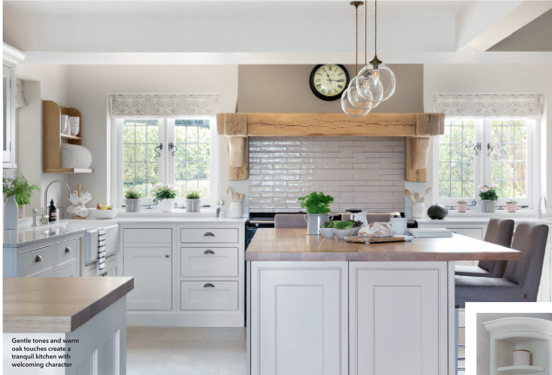
Gentle tones and warm oak touches create a tranquil kitchen with welcoming character