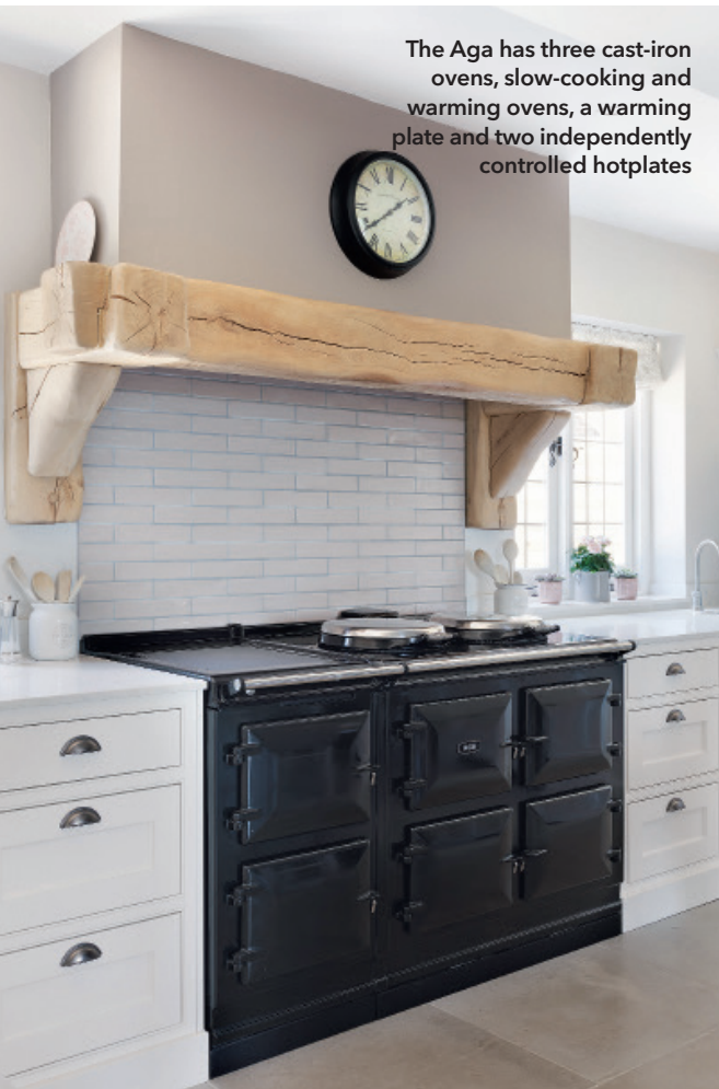
The Aga has three cast-iron ovens, slow-cooking and warming ovens, a warming plate and two independently controlled hotplates