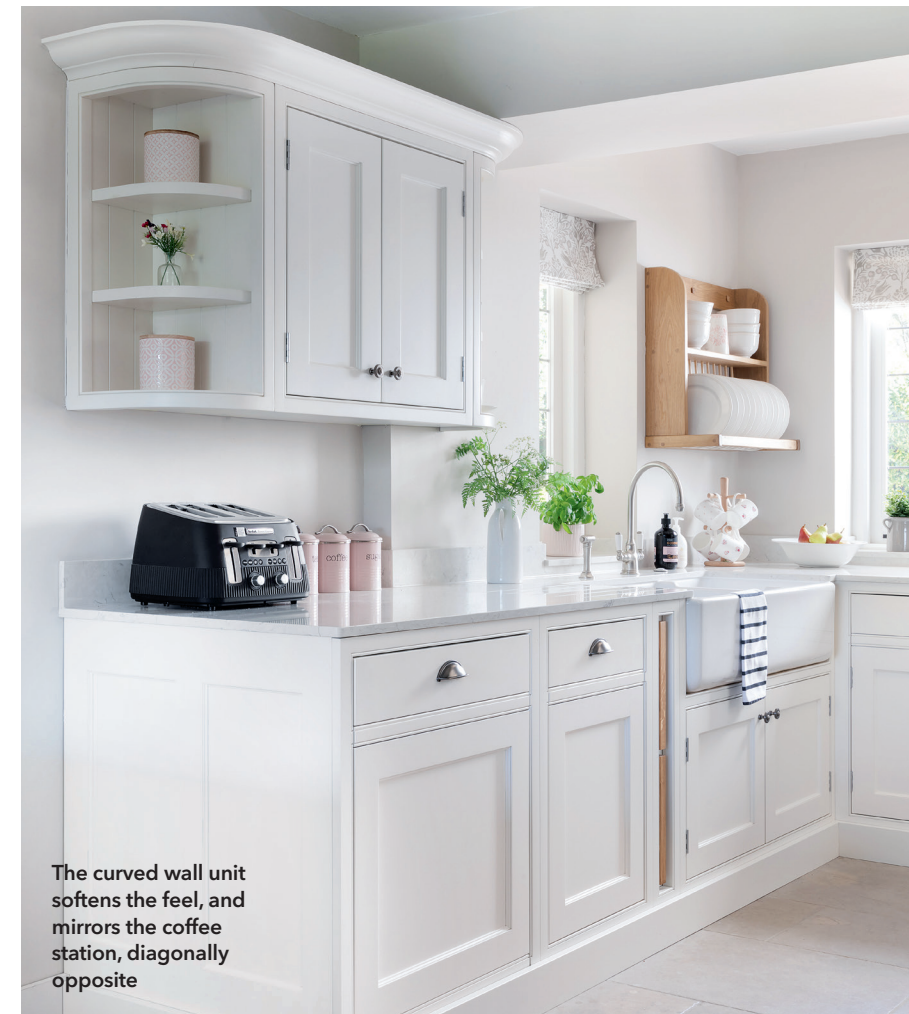
The curved wall unit softens the feel, and mirrors the coffee station, diagonally opposite